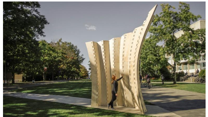
2016 - Robot Made Workshop prototype: Double-Layered Elastic Bending for Large Scale Folded Plate Structures