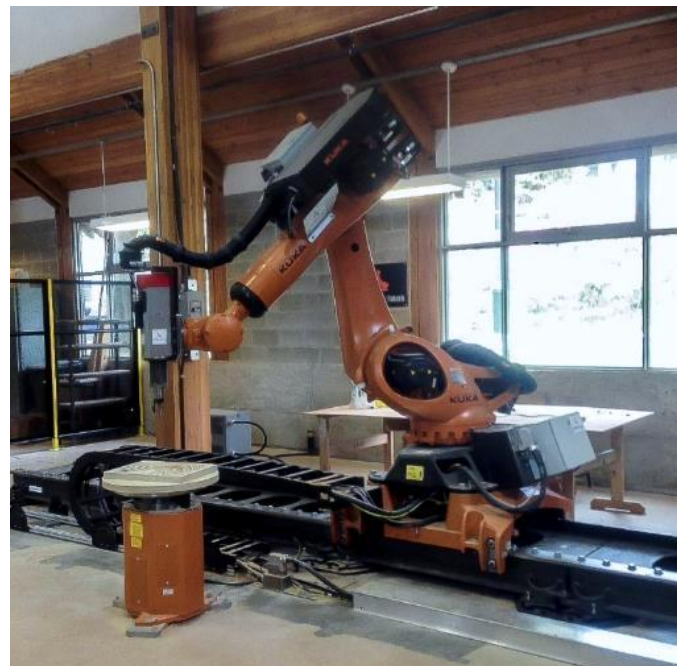
Robotic fabrication setup, Centre for Advanced Wood Processing at the University of British Columbia.